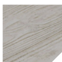
Natural Aged Oak

For use on balconies, terraces, walkways, boardwalks, residential, leisure and commercial