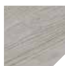
Natural Aged Oak