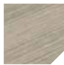
Natural Golden Oak