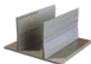
Medium (53mm high)