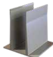
Large (107mm high)